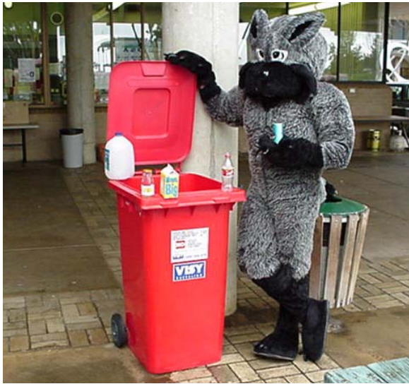
RECYCLE CAT – Deakin University