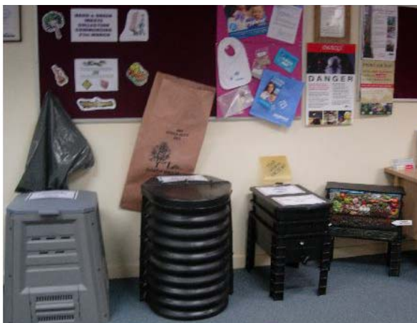
DISPLAY AND SIGNAGE FROM YARRA RANGES ECO LEADERS