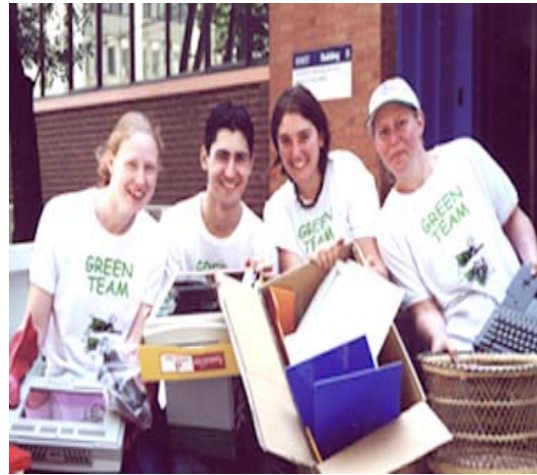
THE GREEN TEAM - RMIT