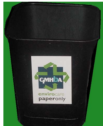
SIGNAGE AT GMHBA